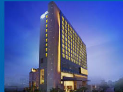
Vivanta by Taj, Gurgaon

CNBC Awaaz Real Estate Award 2013. NDTV Good Times Real Estate Company of the Year -2013 (M.P.) NDTV Property Awards 2014. Golden Brick Award 2016.