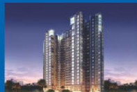
ACTIVE ACRES, KOLKATA