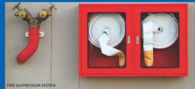
FIRE SUPPRESSION SYSTEM