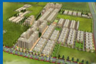
RUCHI LIFESCAPES, INDORE