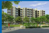
RUCHI LIFESCAPES, BHOPAL