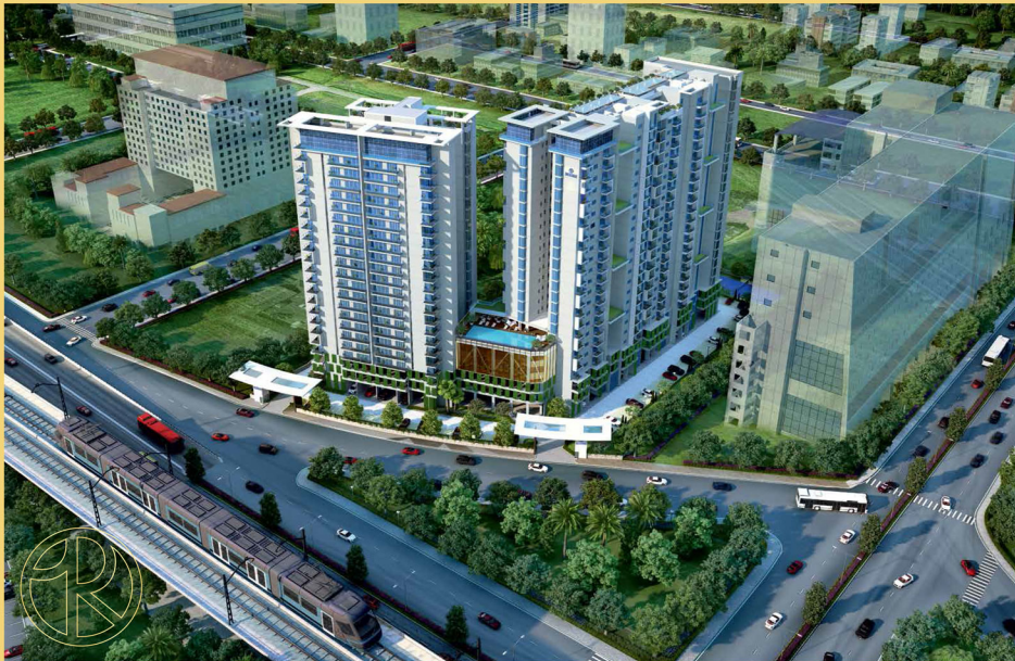
BLOCK C2 & C3 (SERVICE APARTMENTS)