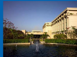
Grand Hyatt Hotel, New Delhi