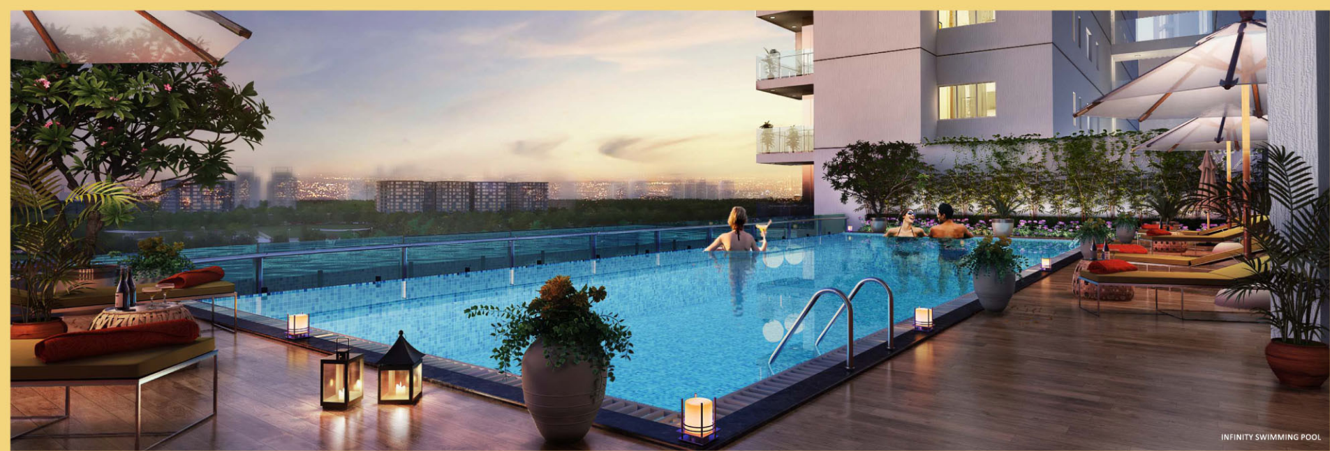
INFINITY SWIMMING POOL