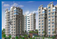
ACTIVE GREENS, KOLKATA