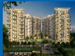
Capitol heights, Nagpur