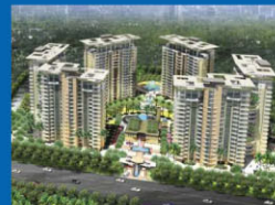
The World Spa, Gurgaon