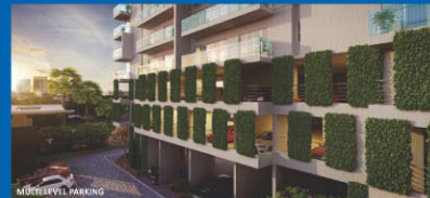
MULTI LEVEL PARKING